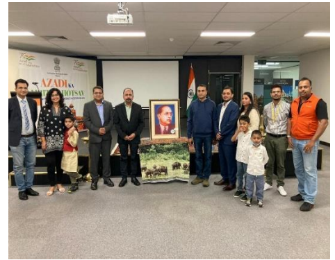
Consulate General of India, Perth along with Ambedkarite Buddhist Community celebrated 131st Birth Anniversary of Bharat Ratna Dr BR Ambedkar on 14 April 2022.