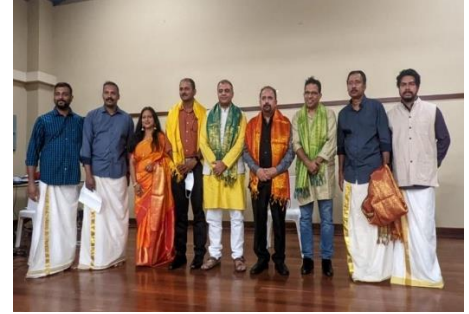
Acting Consul General inaugurated and participated in Vishu (Baisakhi) celebration with Samskruthi Perth and Malayali community on 17 April 2022.